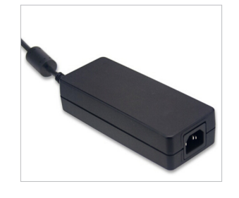
Z3 50W power adapter spare