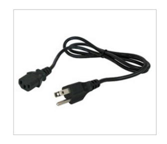
Z3 Power Cord (sold separately)