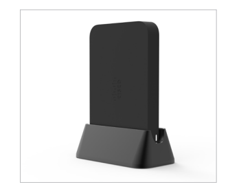
Z3 Desk stand (sold separately)