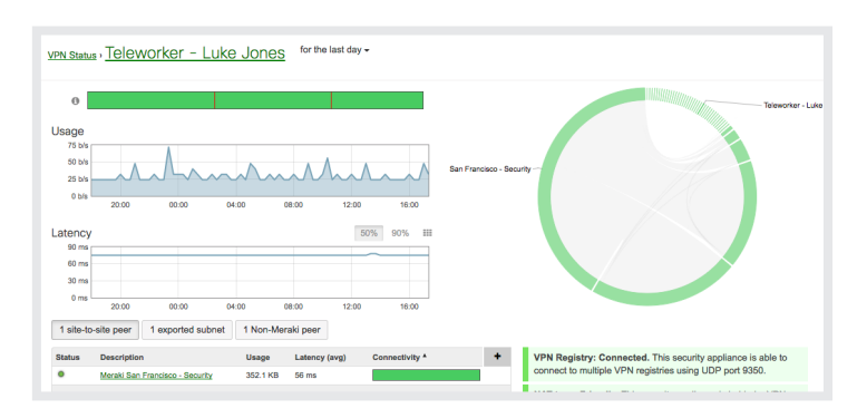
AUTO CONFIGURING SITE-TO-SITE VPN