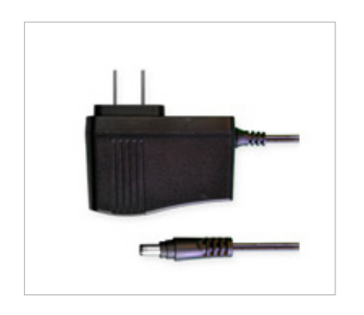
Z1 30W power adapter spare